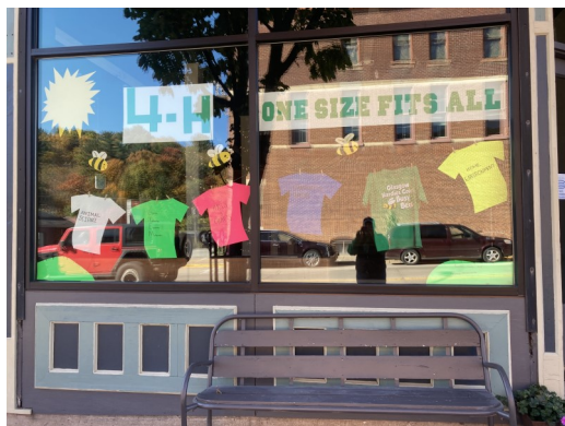
First Place GHCBB's Window Decoration

If you have not already check out the National 4-H Week Window Decorations! Thank you to the Whitehall Happy Hustlers and GHCBBs! Both of them had great window displays and both will be getting a local business gift certificate from the Adult Leaders!