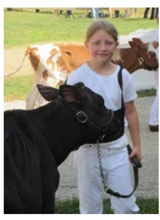
Clover Flyer Dispatch Page 19